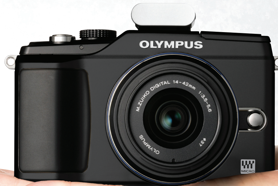
SHOWN ACTUAL SIZE WITH PENPAL

The power of a DSLR. The simplicity of a point-and-shoot. The clarity of an HD Camcorder. And now, new features to make framing, shooting and recording even easier, more accurate, and more personal. The new PENPAL Bluetooth® Communication Device accessory makes your images and movies more accessible – share, save, and store wirelessly. The Olympus PEN® – the best of all worlds in one powerfully simple package.