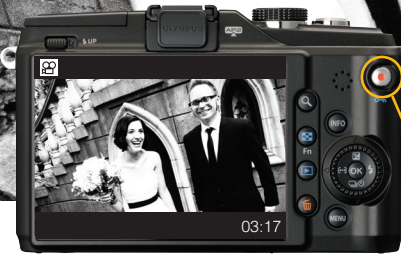
Direct Movie Button